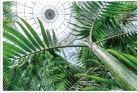
The Palms of the World Gallery of the Enid A. Haupt Conservatory.